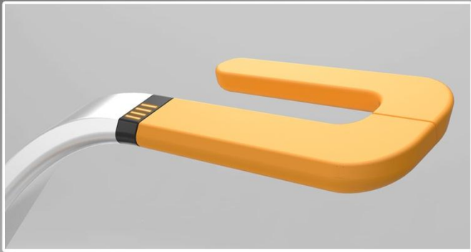
display battery level built into the handlebars